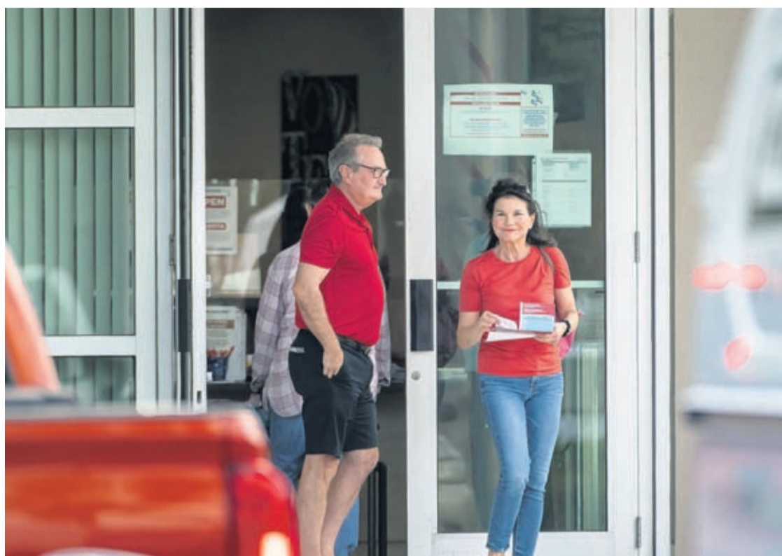
Election officials in some Florida counties urged people to vote early Sunday, Nov. 6, where possible as a potential tropical system threatens the state on Election Day.